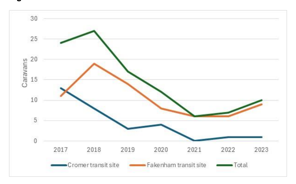
Figure 3.2 Use of transit sites in North Norfolk 2017 to 2023